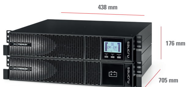
SLC 4000-10000 TWIN RT2